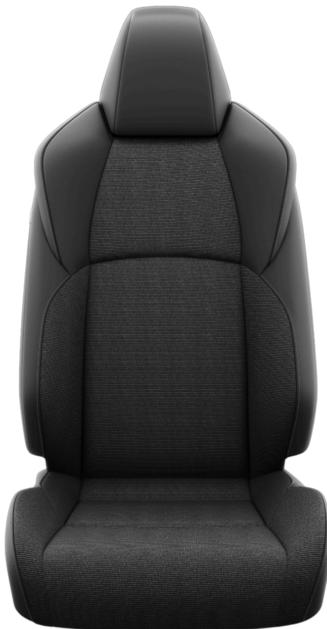
Black Partial Synthetic Leather and Fabric (EB20)