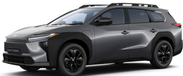
Magnetite Gray (D31) **