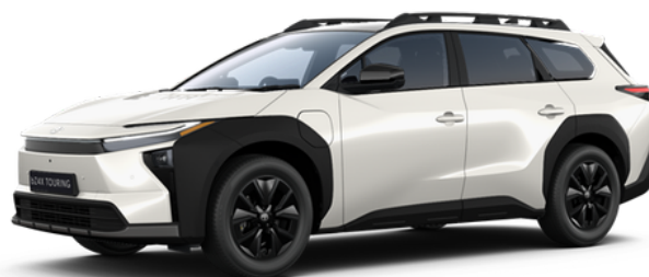
Crystal White (D29) ***