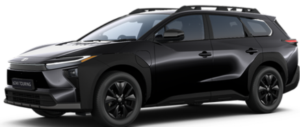
Crystal Black (D32) *