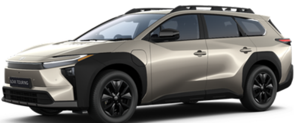
Brilliant Bronze (D35) **