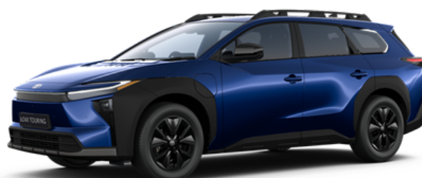
Azure Blue (D33)***

Non-Metallic* Metallic ** Pearlescent ***