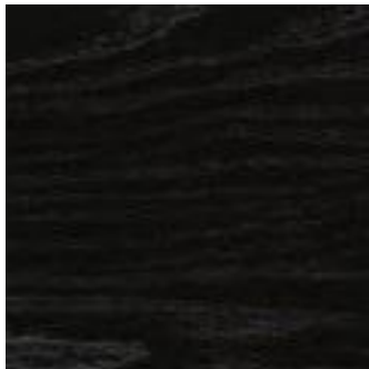
Premium Grade Ash Sumi Black