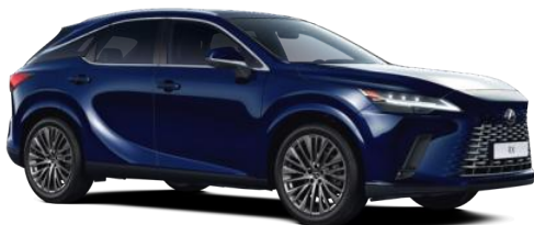
Deep Blue (8X5)