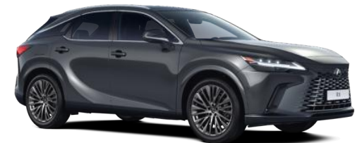
Sonic Grey (1L1)