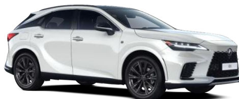
F White (083)**