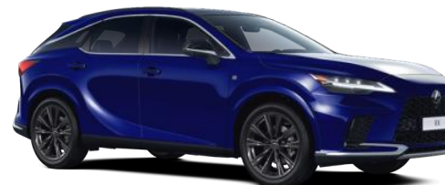
Sapphire Blue (8X1)**

*Not available on F SPORT Design **Only available on F SPORT Design