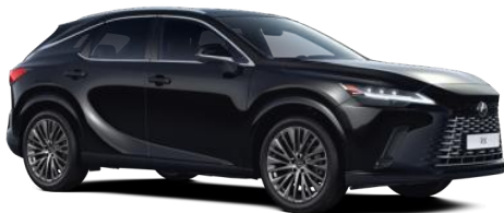
Graphite Black (223)