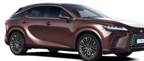
Sonic Copper (4Y5)