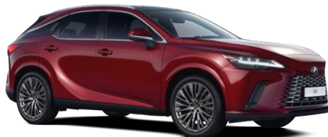
Morello Red (3R1)*