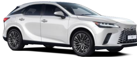
Sonic White (085)*