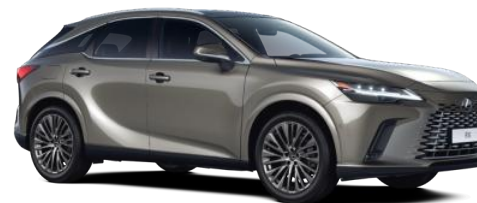
Sonic Titanium (1J7)*