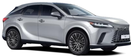
Sonic Platinum (1L2)