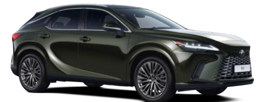
Terrane Khaki (6X4)*