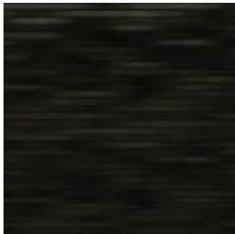
Luxury and F SPORT Design Grade Black Hologram