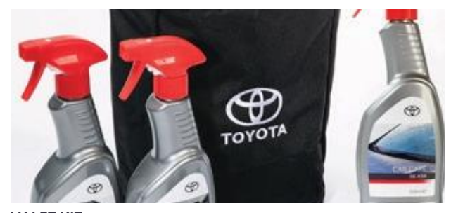
VALET KIT Glass cleaner, dashboard care, de-icer, fabric cloth and a branded storage case.