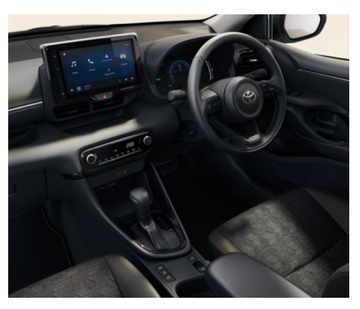
Black embossed fabric with dark grey bolsters and silver stitching (FC20) (Luna Sport)