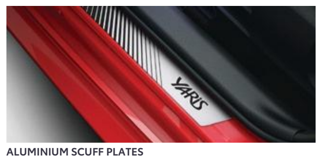
Genuine scuff plates for the door sills create an immediate impression of style while also serving a very practical purpose of protecting the sill paintwork.

Scan the QR Code for more information on accessories.