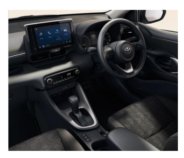
Black fabric, black stitching (FB20) (Luna)