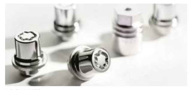
LOCK NUTS Replacing one nut on each wheel with a Toyota hardened steel wheel lock will maximise security for your valuable alloys.