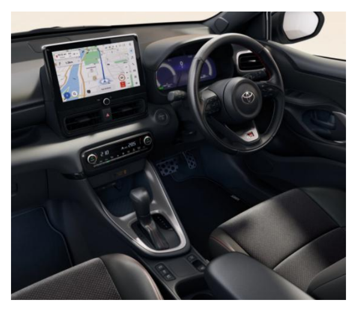
Black perforated Ultrasuede® with leather-like bolsters and red stitching (EB20) (GR SPORT)