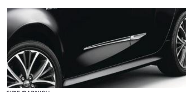
SIDE GARNISH Contoured to integrate smoothly with the side of your car and create a powerful low pro le appearance.