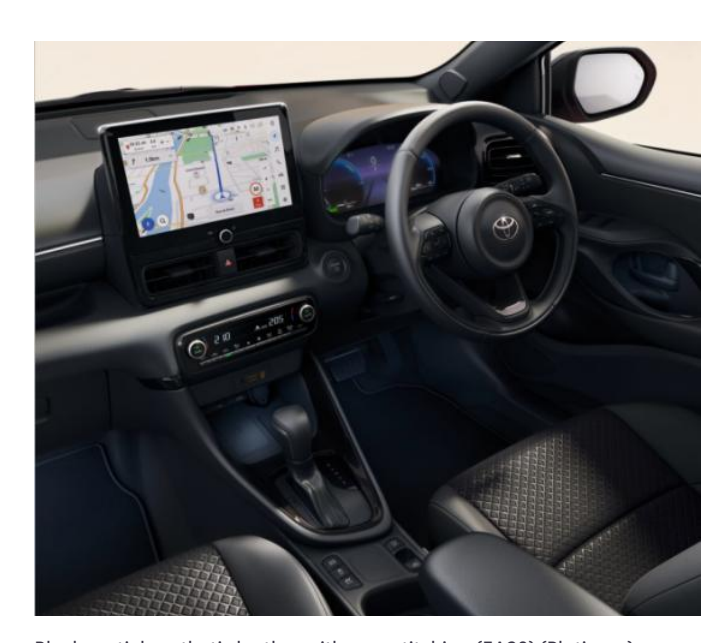
Black partial synthetic leather with grey stitching (EA20) (Platinum) \,