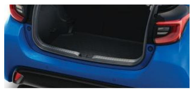
BOOT LINER Tailored to fit the boot of your vehicle and provide protection against dirt and spills.