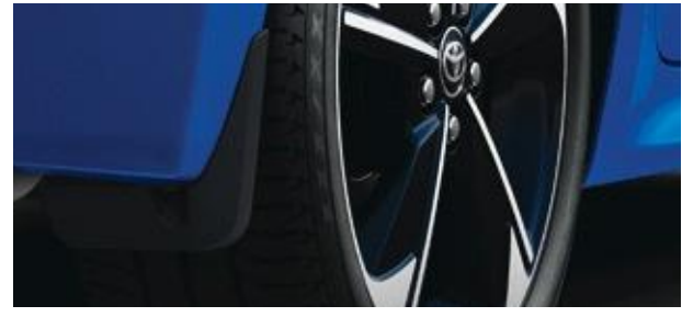
MUD GUARDS Designed to minimise water, mud and stones spraying onto you car's body.