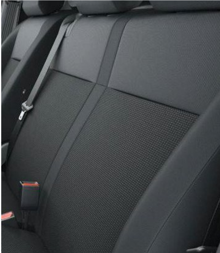
Dark grey fabric (CMFT)

Available in dark grey fabric with a unified black instrument panel that delivers a fresh image.