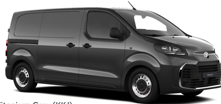
Titanium Grey (KKJ)