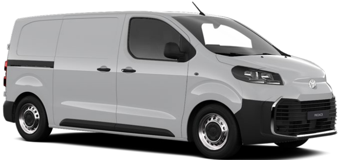
Icy White (EPR)