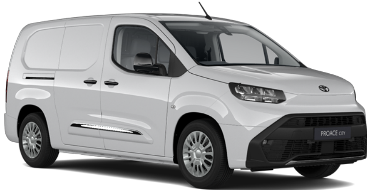
Icy White (EPR)