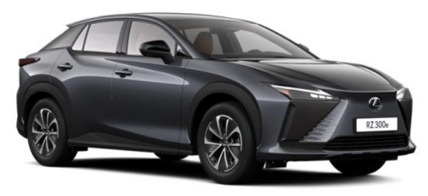
Sonic Grey (1L1)