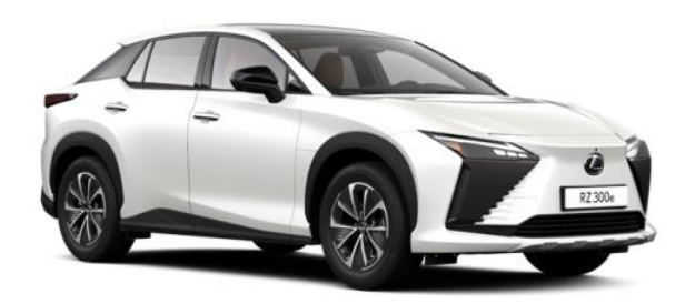
Sonic White (085)