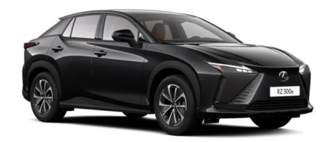
Graphite Black (223)