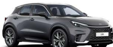
SONIC GREY BITONE (2YH)