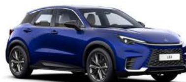
NEPTUNE BLUE (8W7)