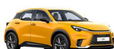
PASSIONATE YELLOW (5A3)*

* Passionate Yellow (5A3) is a solid finish, all other exterior colours are metallic