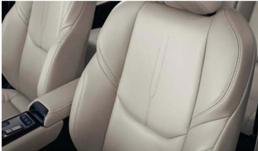
Elegant - Ammonite Sand Tahara Leather (EB00)

A choice of three colours are now available with a unified black instrument panel that delivers a fresh image.