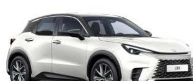
SONIC WHITE BITONE (2YM)