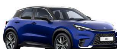
NEPTUNE BLUE BITONE (2VT)