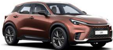
SONIC COPPER (4Y5)*