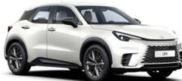
SONIC WHITE (085)