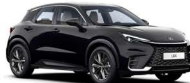
MIDNIGHT BLACK (209)