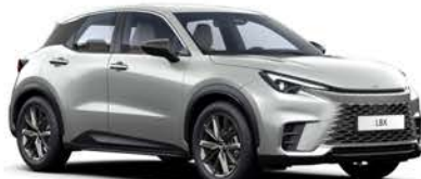
SPARKLING SILVER (1F7)