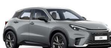
URBAN GREY (1H5)