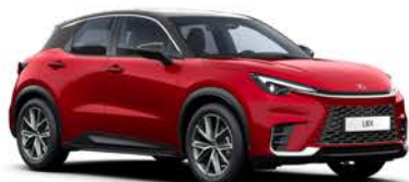
RUBY BITONE (2TB)