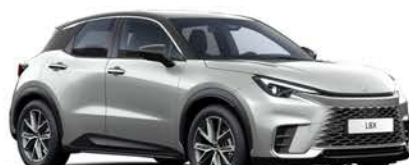
SPARKLING SILVER BITONE (2LB)