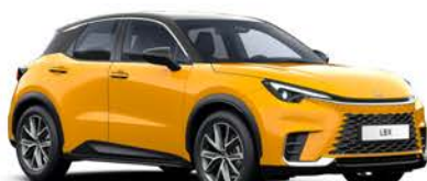
PASSIONATE YELLOW BITONE (2PQ)