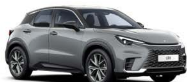
URBAN GREY BITONE (2YN)