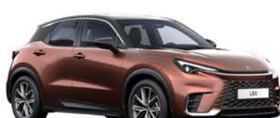
SONIC COPPER BITONE (2YF)