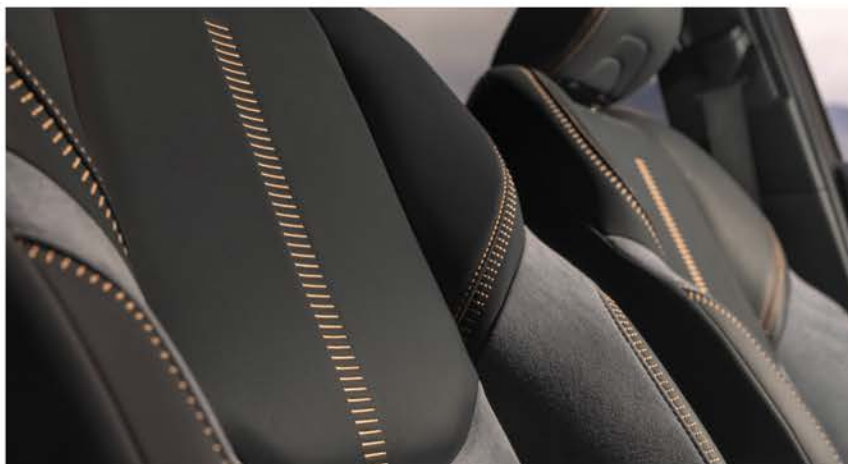
Leather and Ultrasuede® Upholstery with Copper Stitching (FA20)