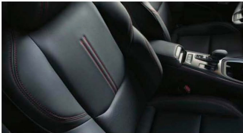
Emotion - Black Perforated Tahara Leather with Red Stitching (EA20)