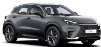
SONIC GREY (1L1)