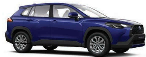
Cobalt Blue** (8W7)