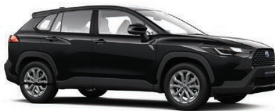
Attitude Black** (218)