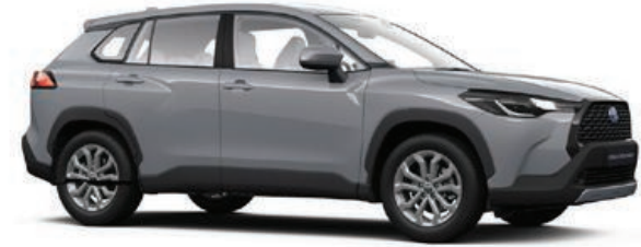
Manhattan Grey** (1H5)