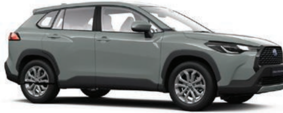
Urban Khaki** (6X3)