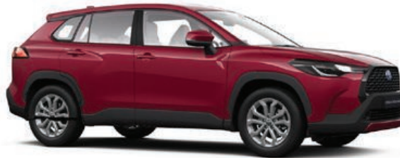
Tokyo Red*** (3T3)