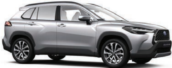
Atomic Silver** (1L0)