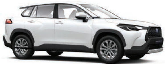
Pearl Ice White*** (089)